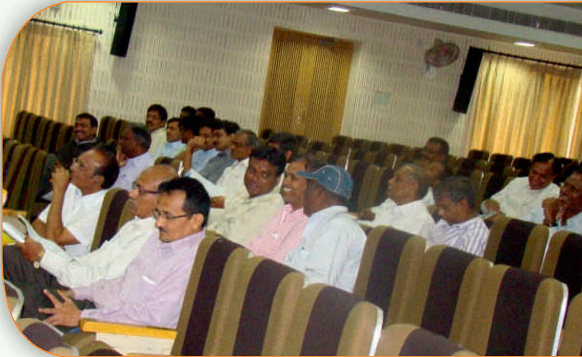
A section of Maytas Infra Limited shareholders seen here participating in the meeting