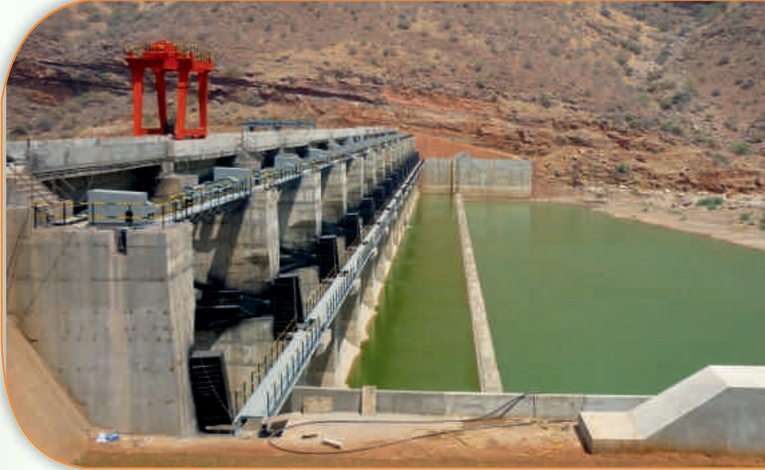
Galeru Nagari Sujala Sravanthi (GNSS) Project, Kadapa, Andhra Pradesh