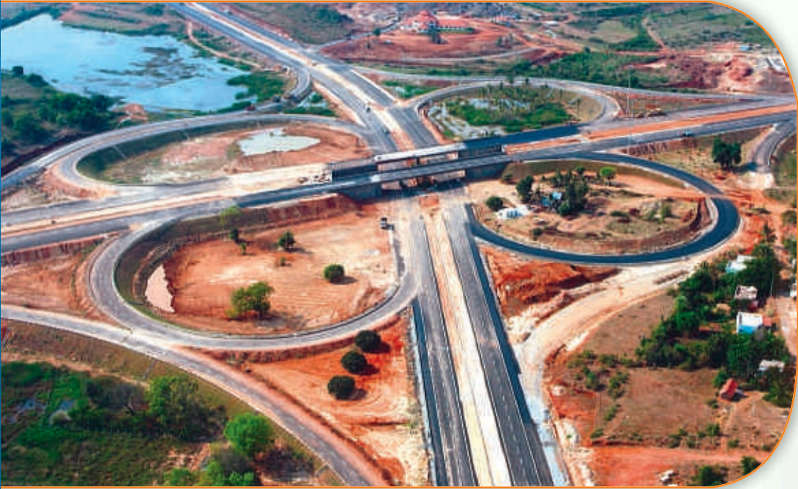
NICE Project, Bengaluru