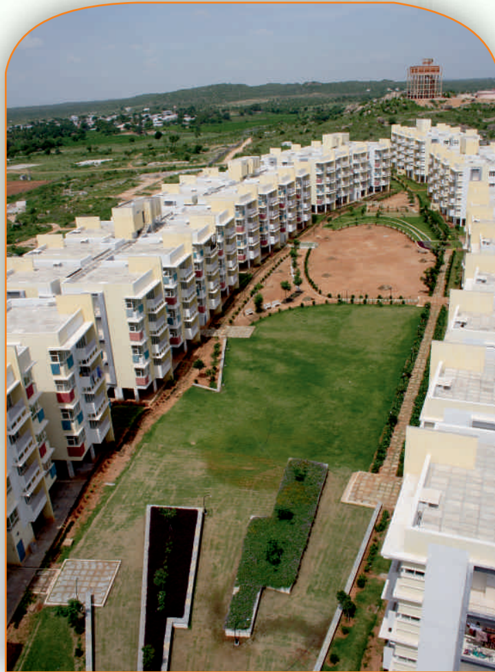
Singapore Township, Hyderabad