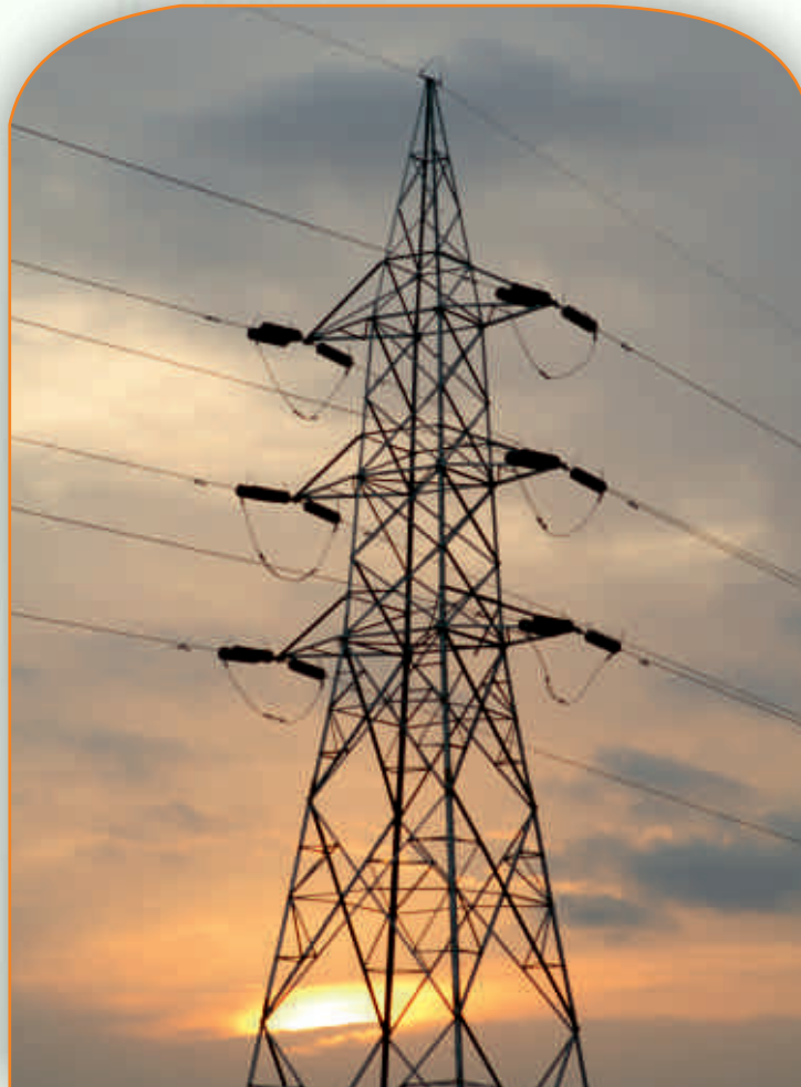
Transmission Line at Hubli for Karnataka Power Transmission Corporation Limited.