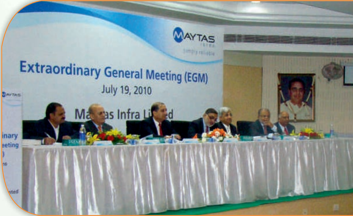
The Board members along with the Company Secretary seen here taking the queries from the shareholders