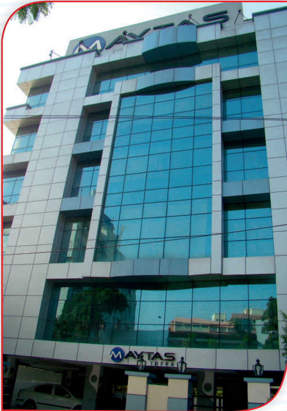
Maytas House - Head Quarters of Maytas Infra Limited