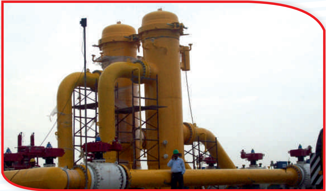
Asia's largest metering Skid erected by Maytas Infra Limited at Jamnagar in record time