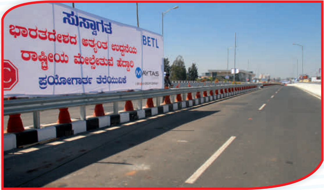
Bangalore Elevated Tollway which was inaugurated by Honourable Union minister for Road Transport and Highways Sri Kamal Nath